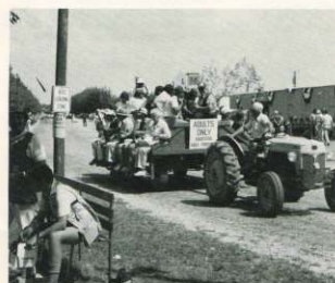
Transport to the ranges.